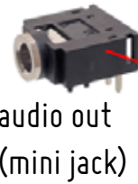
audio out (mini jack)

introduce it in this side of the board and soldering in the other